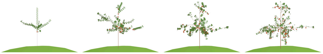
Figure 1: A simulated apple tree from the second through fifth year of growth