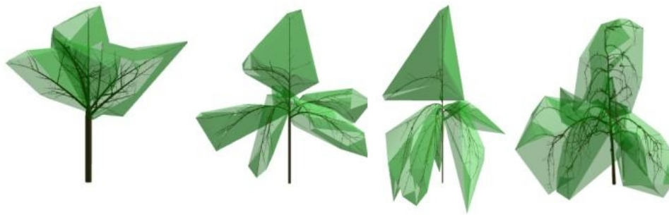
Figure 2: Fuji tree shapes in the fifth year of growth. From left to right, three trees simulated with different values of the pipe model exponent ( P = 2.0 , P = 2.5 & P = 3.0 ), and a digitised tree. The envelopes on the trees are calculated for branching systems originating in the second year of growth.